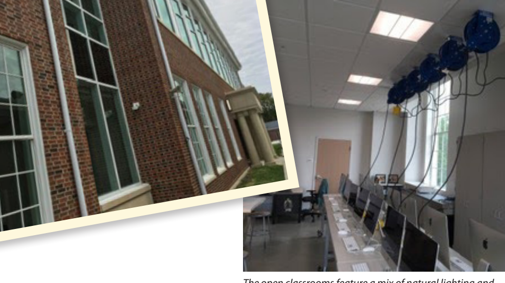
The open classrooms feature a mix of natural lighting and LED lights.

The newly-renovated Larry Larson Middle School building held an open house in August and showed us all how the developers did a fantastic job of blending the old and new with a facade that matched the existing structure but also updated to best meet the needs of students and staff.