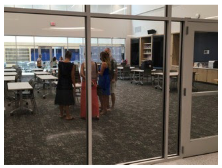
With wings dedicated to math, language, science, business and arts, classrooms can be opened up via "garage doors" to a giant open forum.