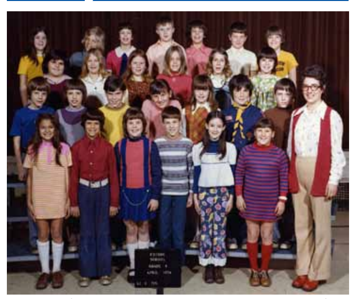
Hey Class of '82 – How many classmates do you recognize from 4^{th} grade?