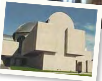
The African American Museum