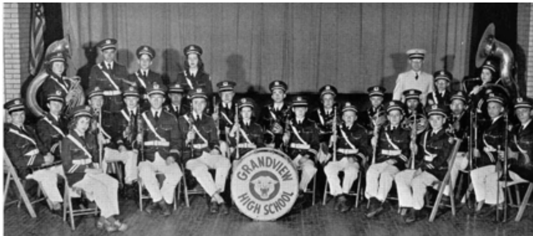
The GHS Pep Band, taken during basketball season in 1943.