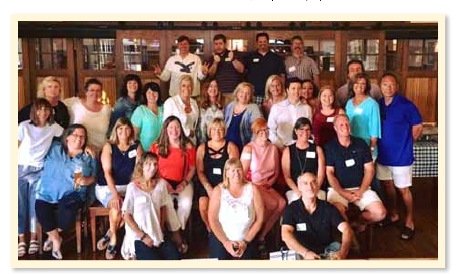
The drinks, stories, photos and even "shot-skis" flew as the Class of 87 reunited at Hofbräuhaus.