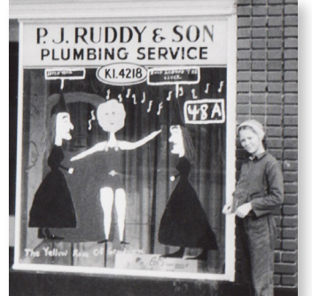
The Yellow Rose of Grandviewv