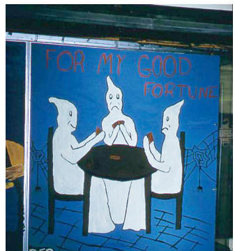
For My Good Fortune