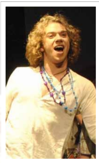
Even going to auditions that

I feel very fortunate to have the work I have thus far having already sung a concert version of Ragtime , played an extra on Smash , and taken part in a staged reading of a new musical. I'm almost ready to open up Showgirls the musical down in the village and after that I'll begin rehearsals for a musical version of Madame Bovary . Every opportunity is a blessing and I couldn't be happier to have them.