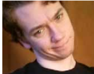
York has that in spades.

Even going to auditions that fail gives me a sense of purpose out here. Every opening door into an audition brings exhilaration. Singing alongside other artistically gifted people, waiting for your turn, belting out to the rafters, and anticipating a return for your hard efforts makes me feel good about what I do in this business. Joy mixed with heartache is what working in theatre is all about and New