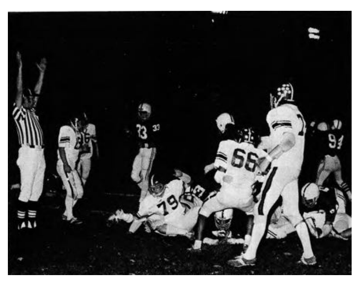
One of many Grandview touchdowns

light the pit. The band would play. Everyone would cheer when the pit was lit, knowing there would be roast beef sandwiches galore the next day. Adults would play poker in a tent late into the night. There was plenty of food, games and