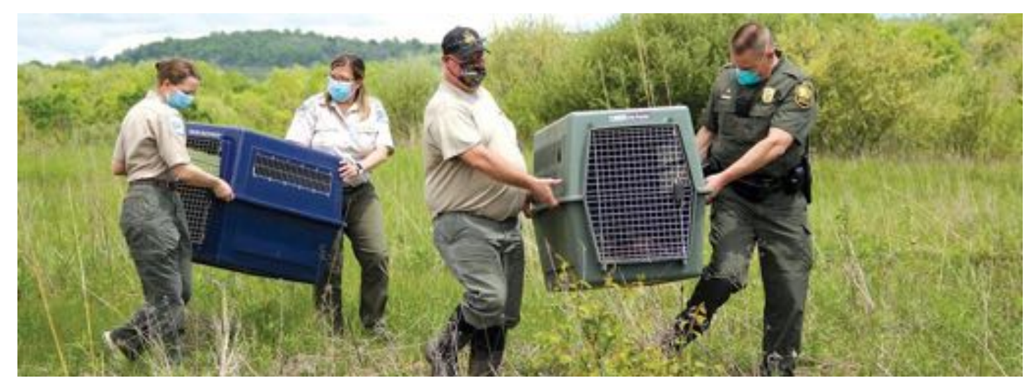
Lake Metroparks employees transporting bobcats

The last two cats that the center worked with — a male and female — were raised and then released back to the wild just this past May. I was fortunate to tag along that day to take the photos for this story. The two were found orphaned as 8-week-old kittens last fall in Belmont County. "They weighed just 2 pounds each when we received them and they definitely did not want anything to do with people — which is a good thing," Keller says. "We began feeding them formula, which they lapped, then eventually