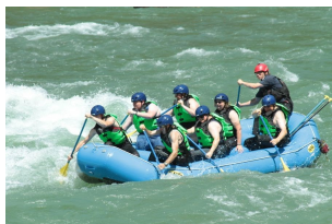
How I spent my summer vacation!