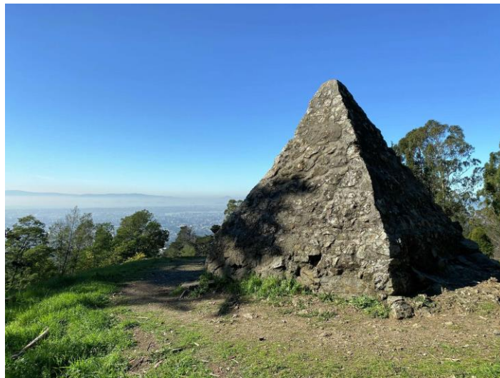
Mystery Pyramid in the Oakland Hill's (Click on Picture for the story)