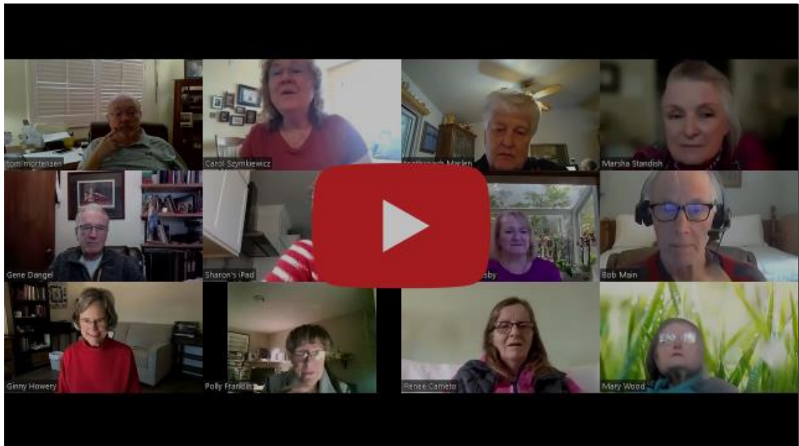
Skyline Zoom February 14, 2022

We are an extended family.....with all that implies. ❤️ sdc