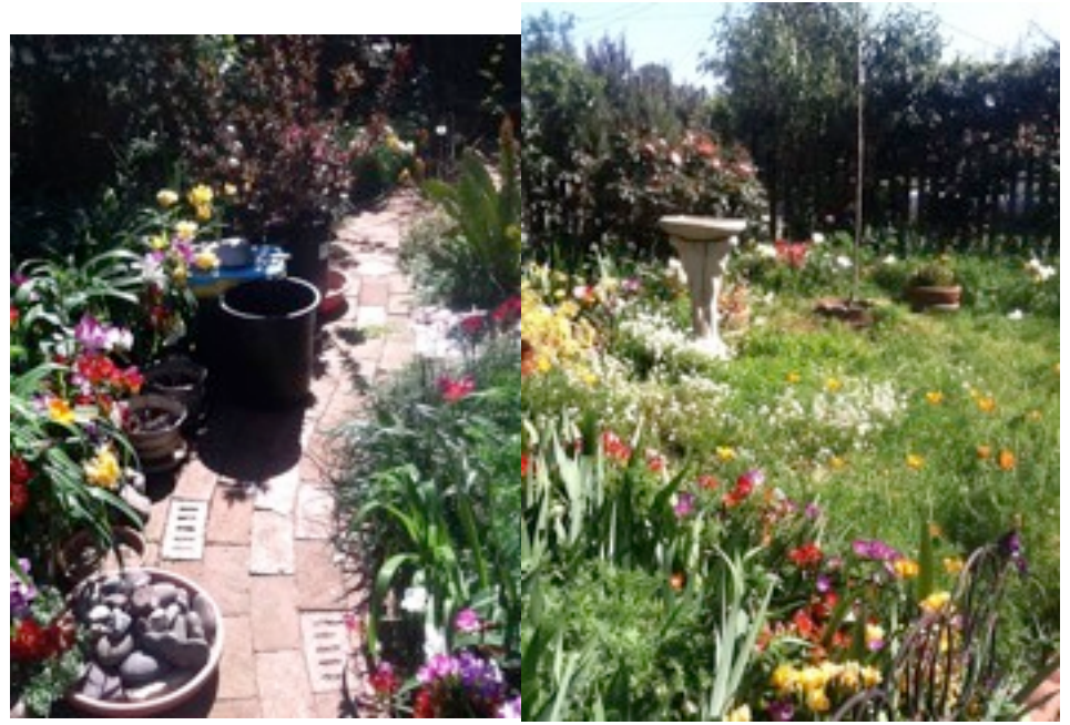
for all the gardners: http://naturesacred.org/garden-havens-an-interview-with-jan-johnsen/