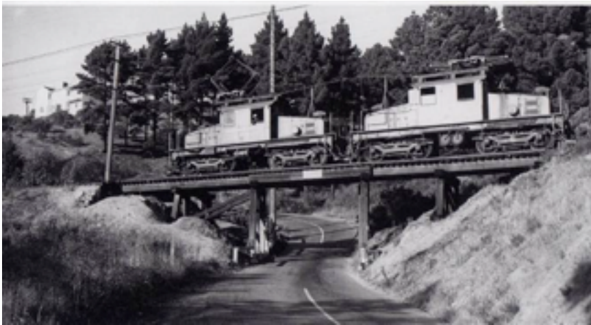
(Left) Motors 603 and 604, operating in tandem as usual, reflect the afternoon sun as they cross the Snake Road trestle in Montclair in 1945. (Charles Savage)

Sacramento Northern Snake Road bridge, now a part of the "Montclair Railroad Trail," 2014 (Google street view).