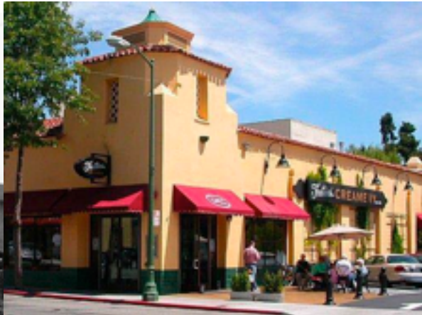
Yesterday and today