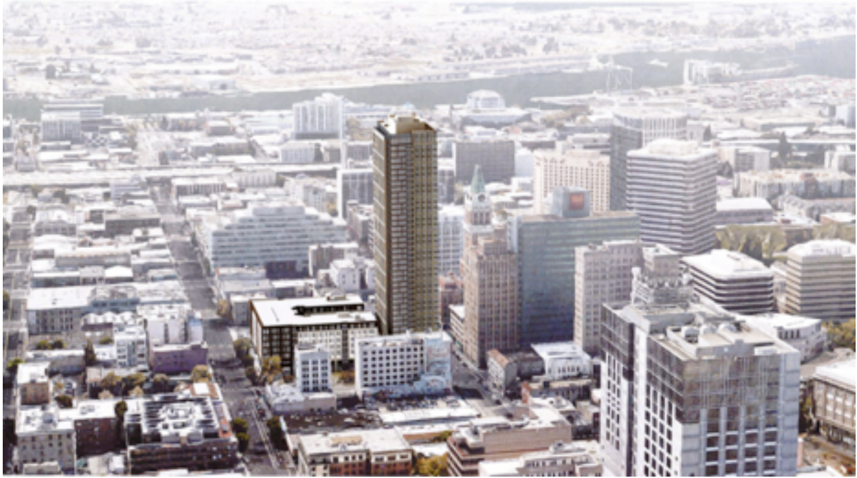
A rendering of a 634-unit residential tower proposed in downtown Oakland. Solomon Cordwell Buenz