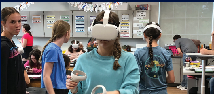
Larson Middle School students virtually explored future careers when Columbus City Schools Career Technical Education representatives visited our classrooms and shared 23 career industry options via 3D virtual reality glasses. Students experienced what careers in architecture, construction, health sciences, IT, public safety, manufacturing, transportation, and medical engineering would actually look like.

A Grandview Heights Schools Strategic Plan priority is Personalized Learning, specifically to expose all students to career, college, military, and entrepreneurship pathways, remove barriers to participation, and celebrate student success in all pathways. We do this by offering our students authentic and engaging learning experiences.