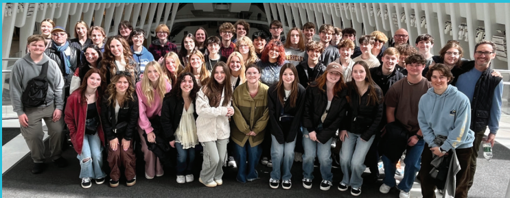
The Grandview Singers and Concert Choir ventured to New York City to perform and tour musical, historical, and artistic venues.

This spring, Grandview Heights High School students could be found engaging in real world experiences, literally around the world! Our students traveled to Greece, Italy, Spain, and Morocco to study culture, architecture, art, and so much more.