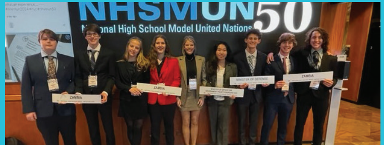
Our Model UN team traveled to New York City to compete in the 50th National High School Model United Nations Conference where they received the Award of Excellence for Overall Performance.

A Grandview Heights Schools Strategic Plan priority is Personalized Learning, specifically to expose all students to career, college, military, and entrepreneurship pathways, remove barriers to participation, and celebrate student success in all pathways. We do this by offering our students authentic and engaging learning experiences.