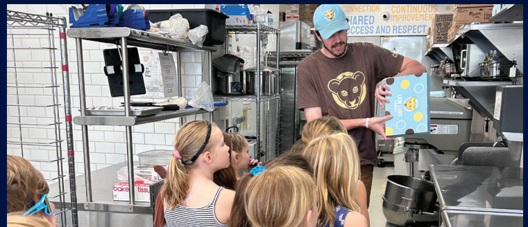
Stevenson Elementary second graders trekked to Grandview Avenue to learn about running a business from four local companies. The Grandview Theater, Lion Cub's Cookies, Pure Imagination Chocolatier, and State of Devotion generously shared their operations and knowledge in an interactive and fun way.