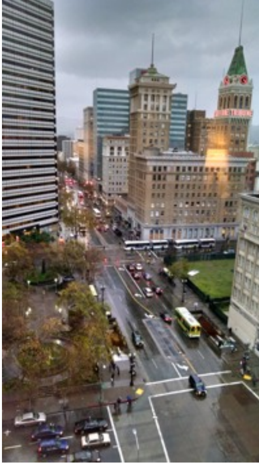
My photo from the 14th floor. sdc