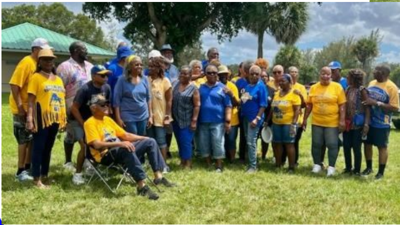
Labor Day Picnic Bulls just want to have fun—together 6t4 6t5 6t6 6t7